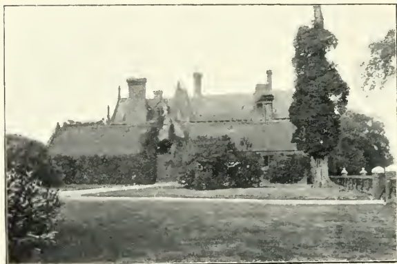
GAWDY HALL—SOUTH SIDE.