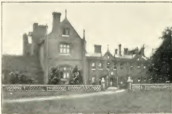
GAWDY HALL, NORFOLK - FRONT VIEW.