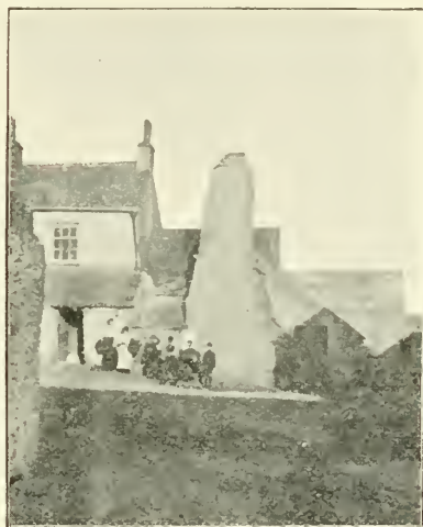
OLD CHIMNEY AT PHILBEACH.