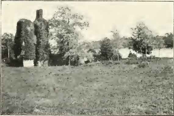
OLD MANOR HOUSE, BOULSTON - WEST END.