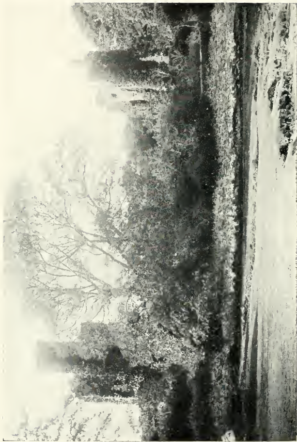
OLD MANOR HOUSE, BOULSTON, IN 1901.